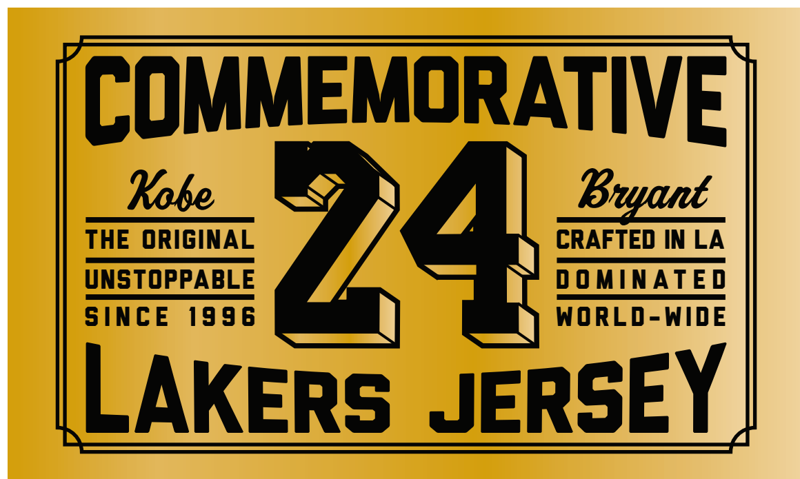
WOVEN COMMEMORATIVE JOCK TAG LABEL